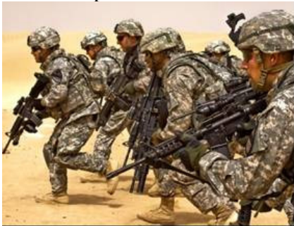
Figure 1. Black surface treatments do not provide either visual or near-IR signature management.

Traditional flat, black surface treatments such as phosphate, anodize, black oxide, and other processes in use today offer no visual, near-infrared, or thermal signature management capability. The lack of these important capabilities leaves warfighters vulnerable to detection thereby placing them at risk during day and night combat operations.