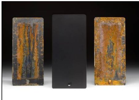
Figure 6. Cerakote™ is corrosion resistant and can withstand 3000 hrs of continuous 5% salt spray.