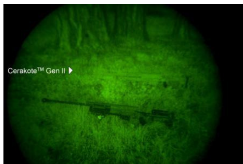
Figure 3. near-Infrared (NIR) signature is managed by emulating the background reflectivity. The weapons on the right are coated with Cerakote™ GEN II.

For night operations weapon signature management is accomplished by the built-in NIR reflective characteristics of the coating. Cerakote™ GEN II which is designed to conform to the NIR reflectivity standards outlined in MIL-DTL-44436. Figure 4