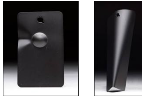
Figure 8. Unparalleled impact resistance assures increased durability while tight bend radii demonstrate good adhesion properties.