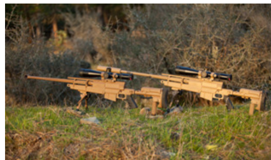
Figure 2. A wide range of colors and patterns are available for visual signature management.